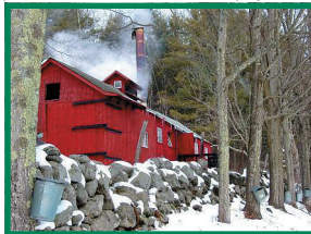
Johnson's Farm and Sugar House ORANGE

in a country setting and visit the store. Turn right off Wheeler Road and you'll return to O r a n g e c e n t e r .