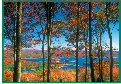
THE QUABBIN RESERVOIR

an all-organic policy. Check out the overlook view of the Quabbin Reservoir as you head down the road to Quabbin Gate 25 . The Quabbin is a premier wildlife habitat and human visitor haven, with 25,000 acres of water surrounded by 81,000 acres of beautiful, protected watershed lands. It is also a birder's paradise.