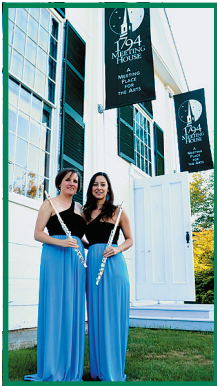
1794 Meetinghouse NEW SALEM

Greek revival building built in 1794 as a church and a public gathering place. Today it is known for offering outstanding musical and cultural programs of wide appeal during the summer. Continue down South Main Street, and you will encounter New Salem Preserves , an apple orchard with 125-year-old apple trees and