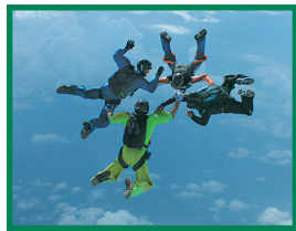
Jumptown ORANGE MUNICIPAL AIRPORT

For more adventure, head down East River Street to Orange Municipal Airport and visit Jumptown jumptown.com the oldest skydiving club in the country and take a dive! In case you brought your four-legged friend, the North Quabbin Dog Park is located near the airport. Open dawn to dusk, and at no charge, let your dog play and have fun too! The annual Yankee Engine-ueety Show cmagma.com is held in June every year at the airport.