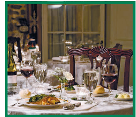
Clamber Hill Inn and Restaurant PETERSHAM

Petersham Craft Center and Gallery is on your left. Find that special gift made by a local artisan or take a class! Along Rte. 32, the Clamber Hill Inn and Restaurant clamberhill.com is located on your left, opposite the sign for Rte. 101. They offer overnights, wine and whiskey tastings