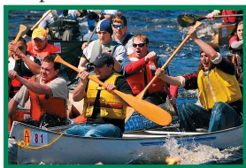
River Rat Race ATHOL

Back on Main Street, continue towards Orange, and the Millers River Environmental Center and Alan E. Rich Environmental Park atholbirdclub.org will be on your right. The center is home to the nationally recognized Athol Bird and Nature Club and the park offers access to the Millers River for canoes, kayaks and small boats, and is the official starting point for the annual River Rat Race riverrace.com every April. The park also offers great opportunities for birding and hiking.