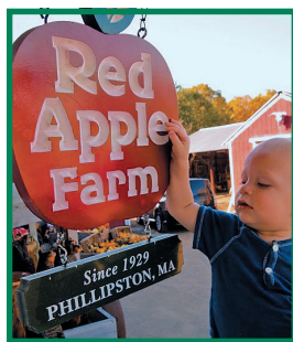
Red Apple Farm PHILLIPSTON

Turn left onto 2A towards Athol. Be sure to make a stop at the Red Apple Farm redapplefarm.com by turning right on H i g h l a n d